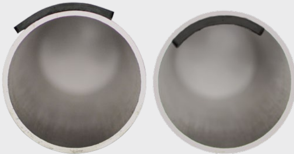
Eddyfi's flexible probes adapt as easily to inside as to outside diameters.

2 Probe can be used with other non-ferromagnetic metals, but performance will vary.