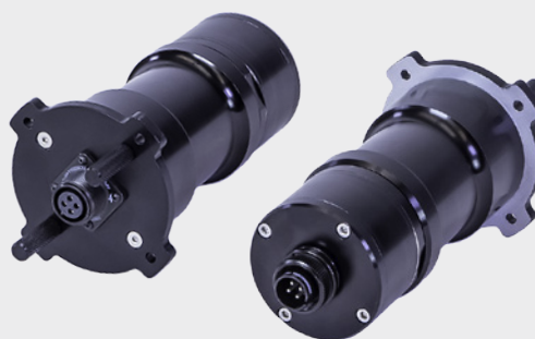
Slip ring (4-pin model shown)