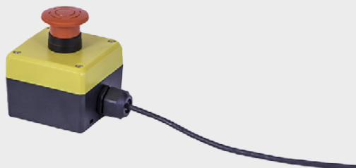
Remote emergency stop button