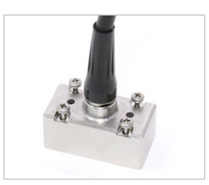
Figure 4: Linear array probe

Linear Array: Also a contact method, standard PAUT probes can be utilized with a OL wedge to take advantage of TFM/ PCI techniques.