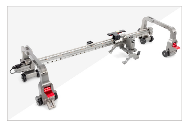
Figure 12: Compatible with local immersion corrosion mapping for high tolerance to surface roughness and imperfections.