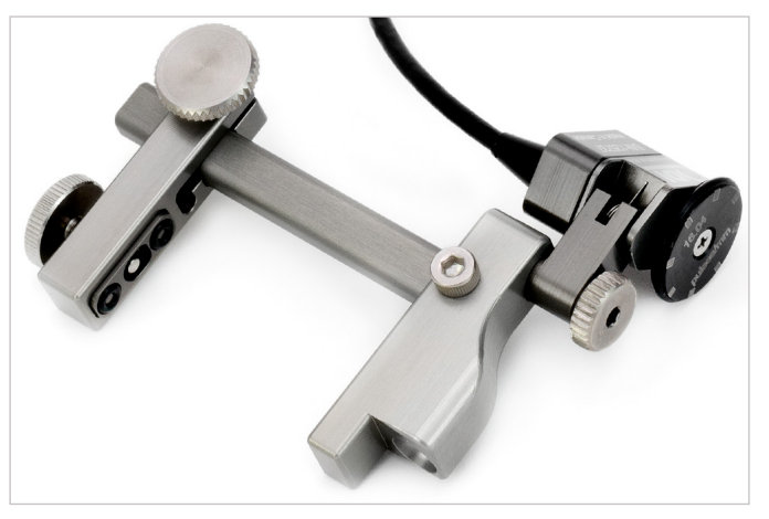
Figure 13: ODI manual encoded scanner.