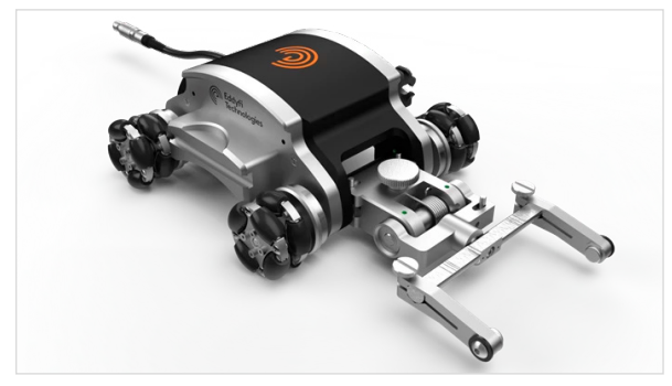
Figure 10: Semi-automated NDT Sweeper for corrosion and weld inspections.

The NDT PaintBrush is an advanced semi-automated corrosion mapping scanner designed for optimal versatility. Its double encoded wheels allow tracking of probe position and orientation, while also allowing accurate mapping even around obstacles.