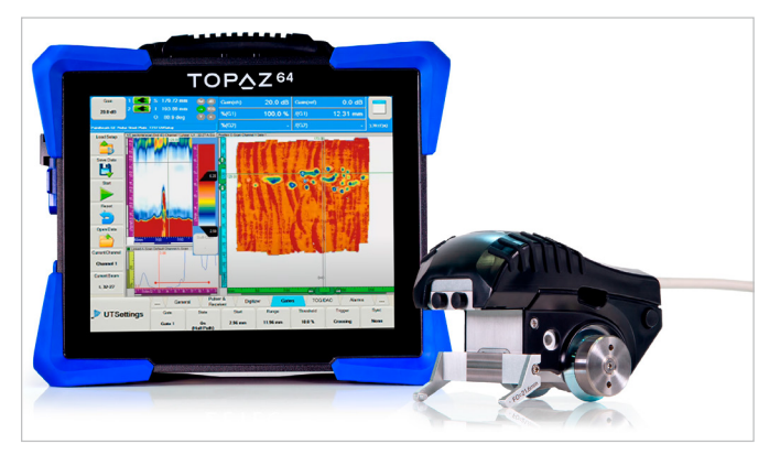
Figure 11: NDT PaintBrush coupled with the industry-leading TOPAZ® ultrasonic instrument.

When there is need to cover larger areas, the use of a lightweight fixed frame XY scanner may be the preferred choice. Boasting an array of application deployment options including the aquablock waterbox for localized immersion corrosion mapping, linear array probes with 0L wedge and dual linear array probes.