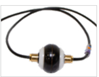
Figure 6: Twin crystal wheel probe.