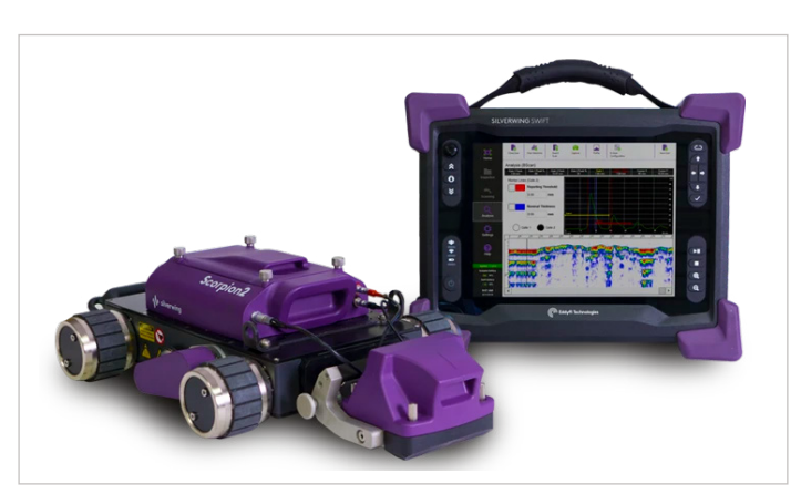
Figure 8: Swift and Scorpion 2 remote-access tank shell ultrasonic inspection solution.