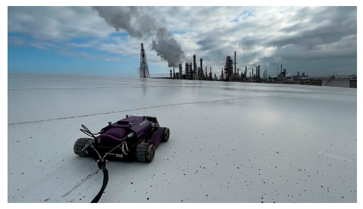
Figure 9: Scorpion 2 inspecting tank roof.