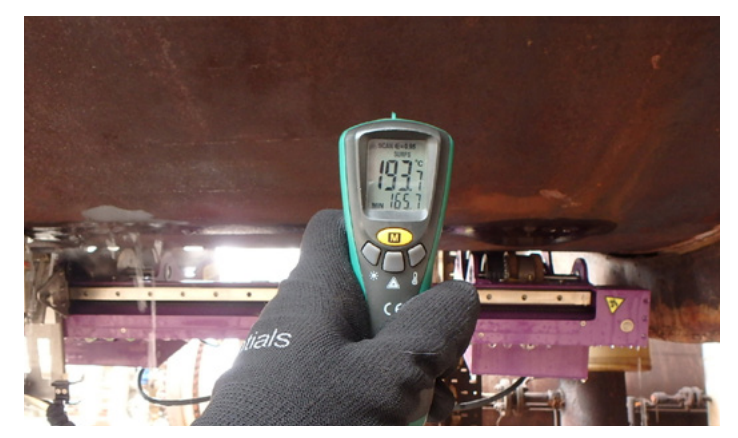
Elevated surface temperature