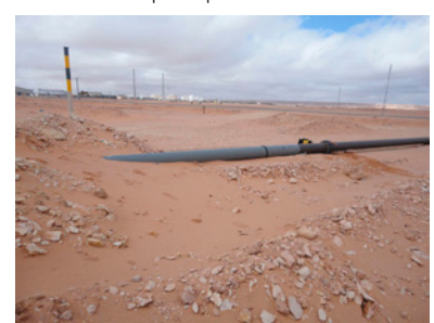
Location photo of typical road crossing

Here, a 30.5 cm (12 in) condensate line was buried at depths 1–2 m (3.3–6.6 ft) and areas of metal loss were identified for follow-up inspection.