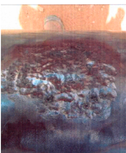
A close up of one area of corrosion identified adjacent to weld

The customer excavated this region to find extensive external corrosion around the weld and in the region adjacent to it. After performing manual UT, the remaining wall thickness was found to be 5.8 mm (0.23 in) from the nominal 9.6 mm (0.38 in). The road crossing was subsequently decommissioned and production flow rerouted through an alternative crossing.