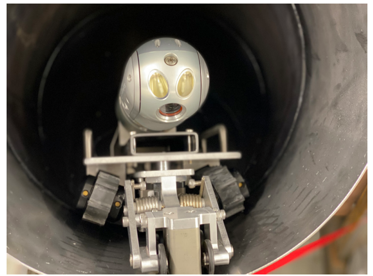
In-house custom system performance verification

The adjustable height magnet tray ensured sufficient magnetic adhesion for vertical travel. The operator could adjust lift-off, or air gap, between the magnet tray and pipe wall as needed. The magnetic balance cart also increased adhesion while climbing the inside vertical radius of the scrap metal chute. The custom solution was validated through initial mechanical modelling techniques to simulate the transitions and later by an in-house test apparatus constructed with the specified segmented elbow.