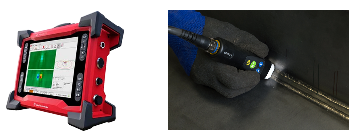
Amigo™ 2 ACFM Instrument for Tank Car External Weld Inspection, ACFM SENSU2 Pencil Probe for Faster Inspections

through paint and coatings, effectively eliminating the labor-intensive surface preparation requirements of MPI. ACFM offers a higher probability of detection, or PoD, and therefore inspection reliability. Commercially available ACFM instruments enable better inspection planning with increased productivity and advanced yet easy reporting. The digital record allows historical data management and more a more robust risk management program thanks to data modelling with more precise information available.