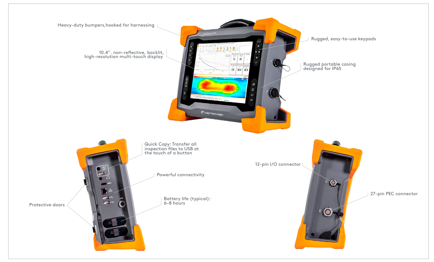
Figure 1: Annotated breakdown of Lyft showing its key features.