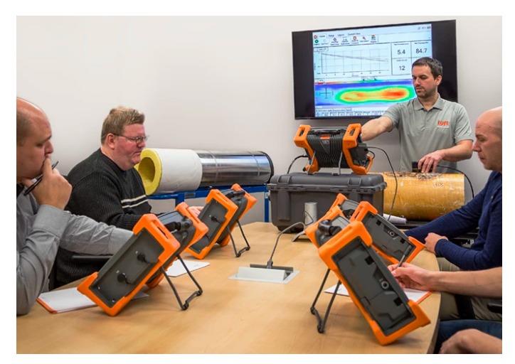
Figure 5: PEC training course.

We are geared to offer blended training: a combination of e-learning and hands-on training at our offices, yours or remotely that will give you the necessary knowledge and skills to efficiently use PEC when inspecting assets.