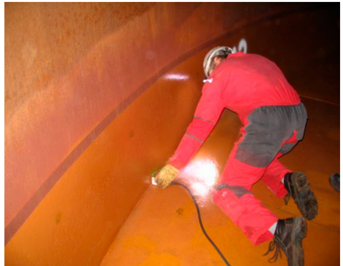
Figure 6: ACFM tank weld inspection.