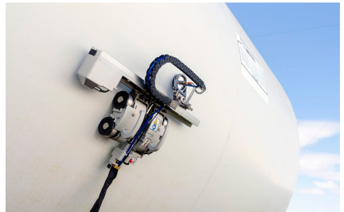
Figure 3: Tank inspection using Nav2 automated crawler/