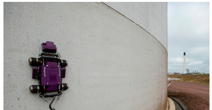
Figure 4: Tank inspection using Scorpion2.