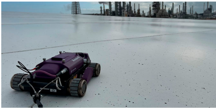
Figure 5: Scorpion2 for inspecting tank roof plates.