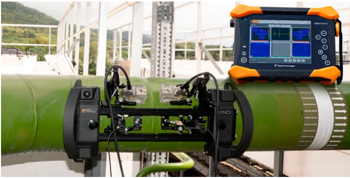
Figure 1: Weld inspection of pipework utilizing LYNCS and Mantis.