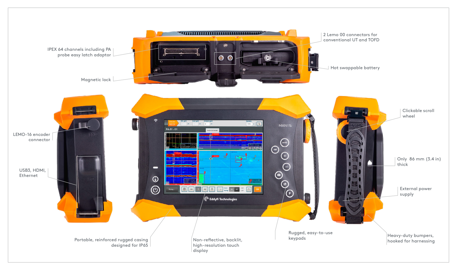
Figure 4: Annotated breakdown of Mantis showing its key features.