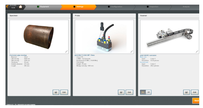
Figure 5: Capture screen with a pipe, probe and scanner.