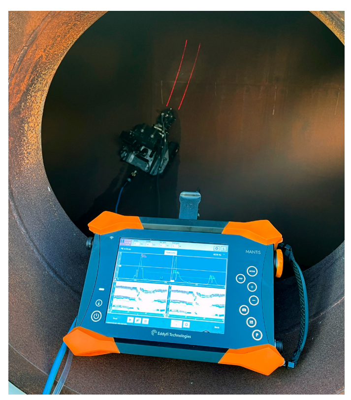
Figure 3: Mantis and VersaTrax™ for remote inspection.