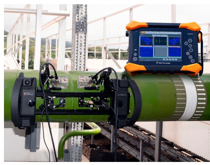
Figure 6: LYNCS scanner with Mantis for pipe inspection.