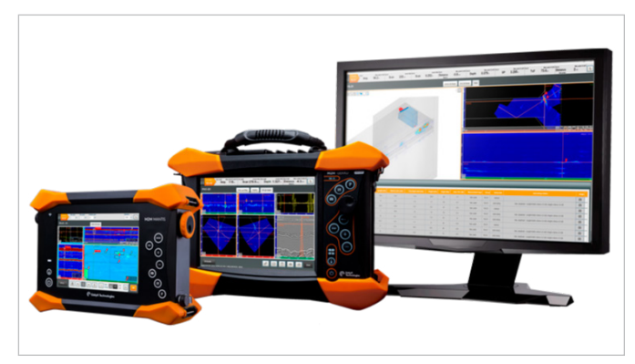
Figure 7: Capture software for Gekko, Mantis, Panther™ enables streamlined conventional & advanced ultrasonic testing techniques.